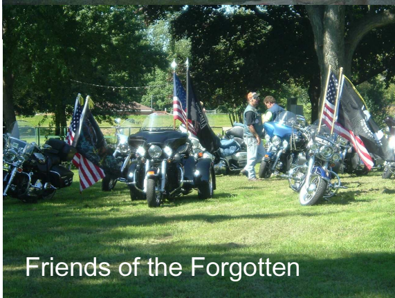
Friends of the Forgotten