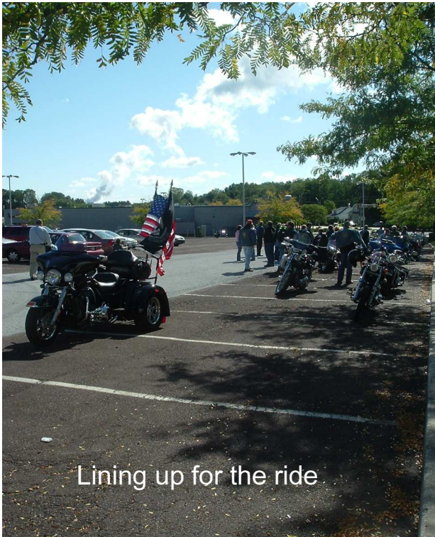
Lining up for the ride