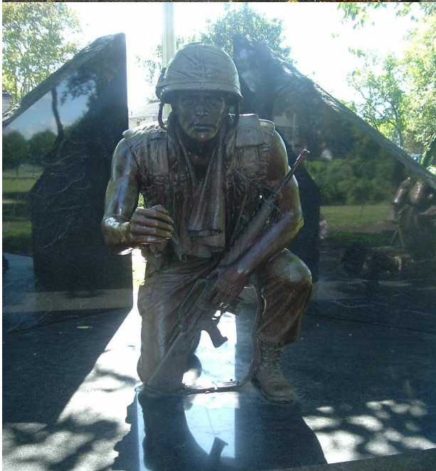
Viet-Nam Veterans Memorial